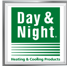
DEALER NAME HERE